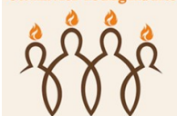
St. Xavier Young Adults

Come join us in the parish center after the 5pm Mass for a little springtime party to celebrate Divine Mercy Sunday! Learn more by visiting www.stxya.com/events .