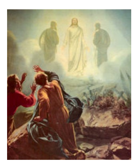
Music March 13, 2022

Opening: How Good, Lord, to Be Here! #877