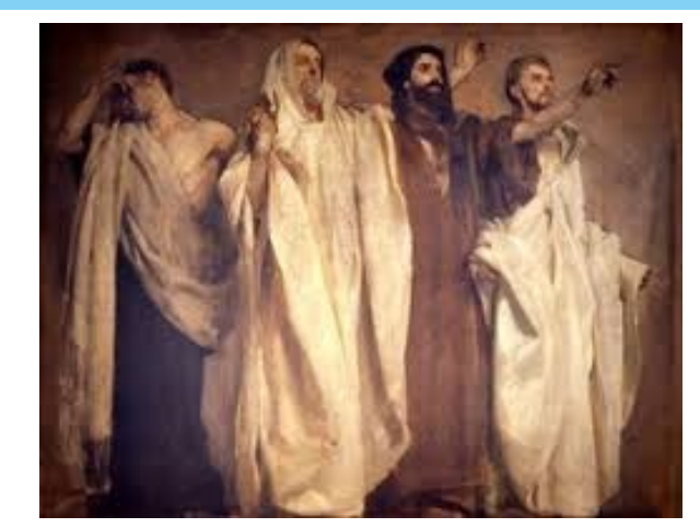
Music January 30, 2022

Opening: Love Divine, All Loves Excelling #641